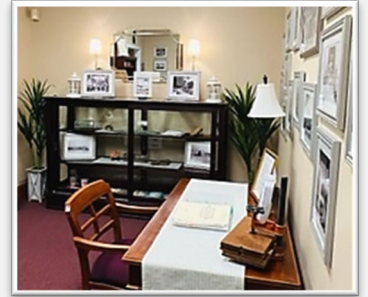
A donation of a beautiful display case from the Miami Theater Center inspired a refresh of the Village Archives this year.