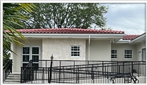
Finishing touches are nearing completion on the much-anticipated new wing.

And speaking of growing...the north addition to the Library is nearly complete! It will be named the Sydow Children and Family Wing and within it, the Bolton Family Theater , both named after the expansion's most generous donors and longtime Shores families.