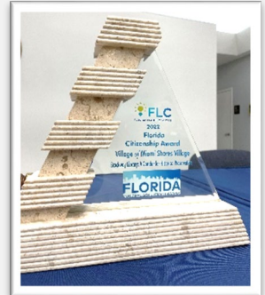
The Florida League of Cities awarded Miami Shores Village the 2022 Florida Citizenship Award for the Library’s role as a “Conduit for Historic Preservation”.