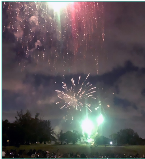
MSV residents and visitors enjoy the fireworks display at the Miami Shores Country Club driving range

During the evening the festivities continued with a bang featuring a spectacular fireworks show, which could be seen from both the Aquatic Center and the lawn of the Miami Shores Country Club driving range.