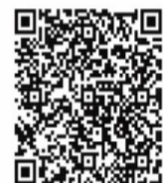
Scan here for project updates!