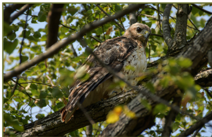
Red-Tailed Hawk perched on a tree.

The Village enjoys its moniker of “The Village Beautiful,” with its lush flora, majestic trees that adorn our thoroughfares, and beautifully maintained landscaping. Along with this reputation comes the preservation of the environment and the animals that have called this area home for decades.