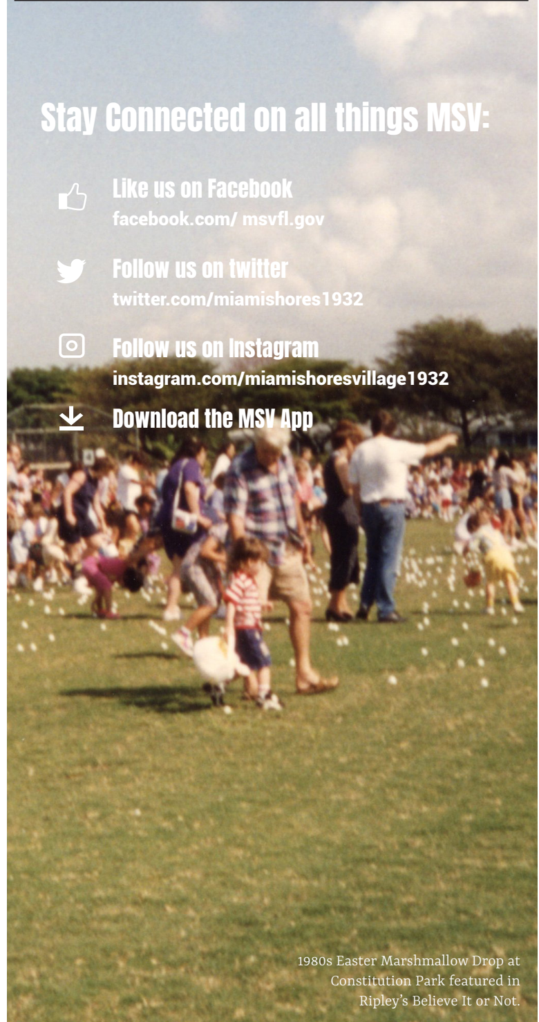
1980s Easter Marshmallow Drop at Constitution Park featured in Ripley's Believe It or Not.