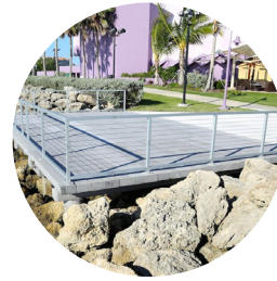
④ Observation Deck