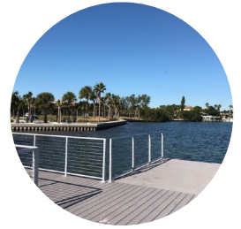
⑤ Observation Pier

Please note, this is a small sampling of waterfront access options and additional images will be available soon.