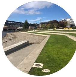
③ Terraced Wall Into Water